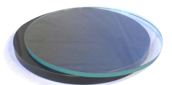
Figure 1: Glass support plate (top), platen (bottom, not included with purchase)

The glass support plate is a smooth, clear 8" \emptyset \times 0.25 " T plate that provides an ultra-flat surface for lapping products (Figure 1). It is intended to be used on top of a standard or magnetic MultiPrep<sup>TM</sup> platen when standard platens do not provide a flat or smooth enough surface due to grooves and/or rough surfaces from manufacturing. Following standard alignment of the MultiPrep<sup>TM</sup>, the glass plate can be used accordingly: